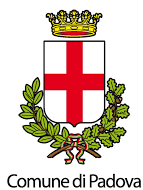
Comune di Padova